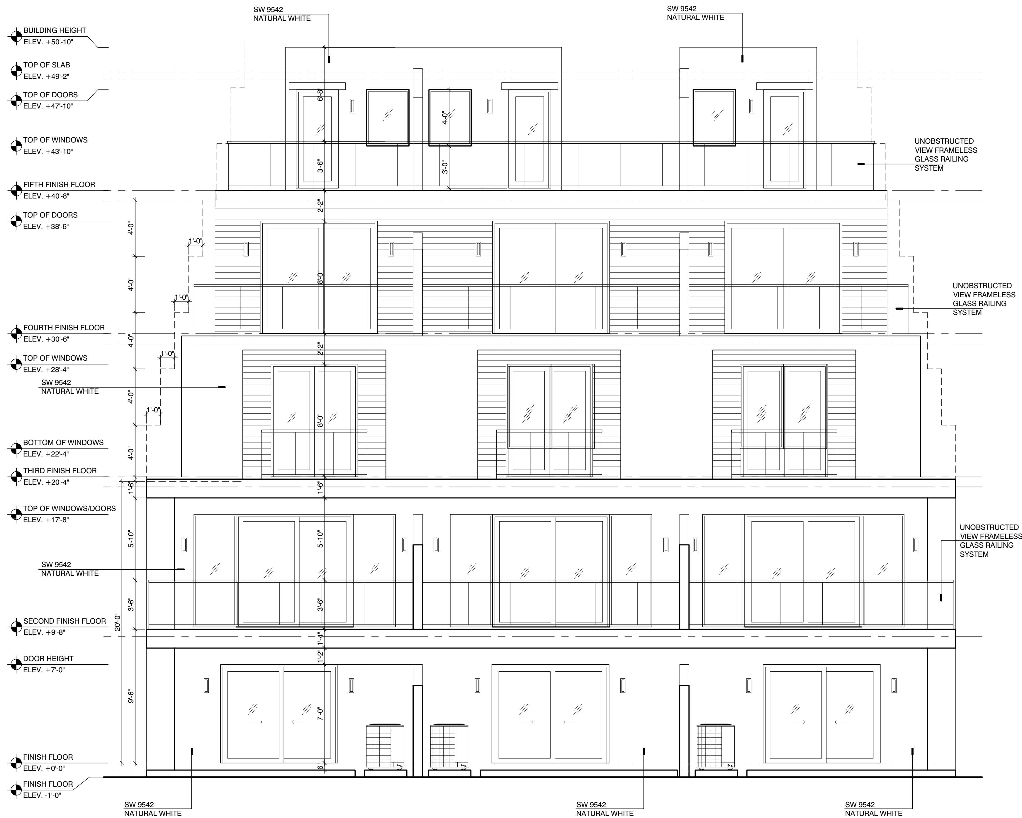
REAR ELEVATION - EAST

P:\PROJECTS SA\241_400 Sunset Drive Pompano Beach Fl 33062_Alt Nazem\Working Drawings\CD\241_AN_100_A-6.0_Exterior Elevations.dwg